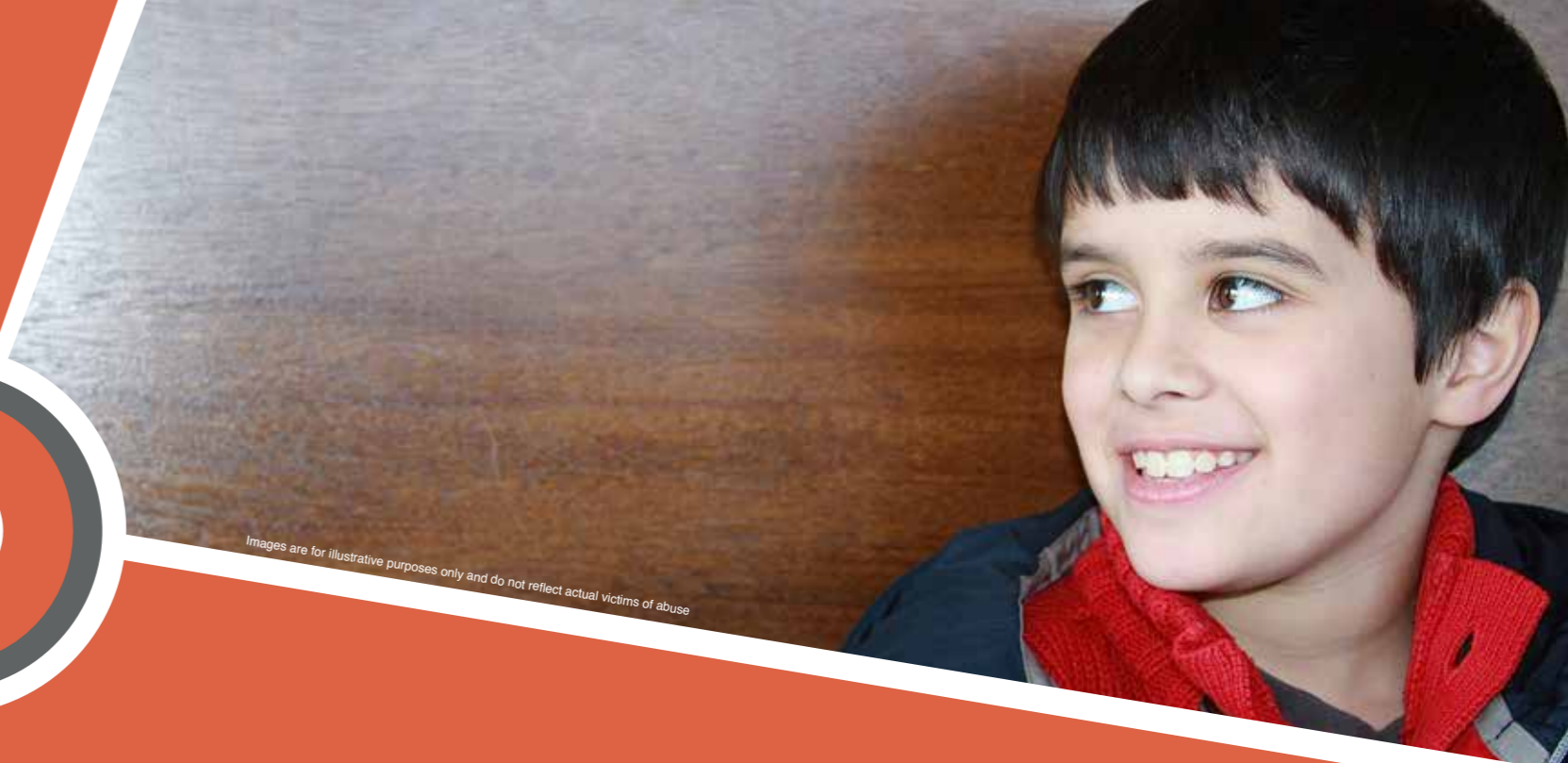
Images are for illustrative purposes only and do not reflect actual victims of abuse